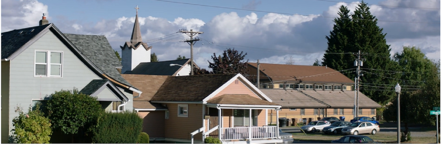
Peace Lutheran Church Tacoma