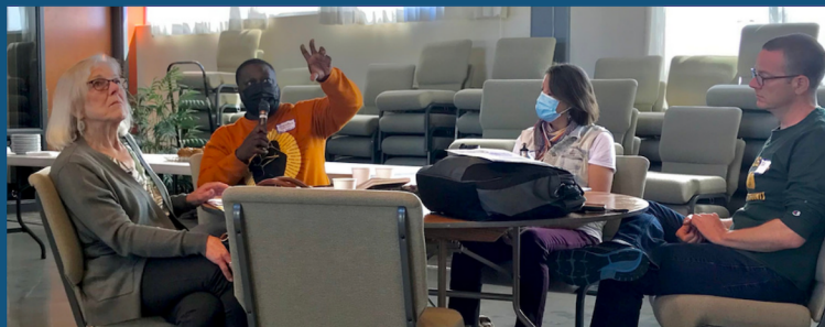
2022 Cohort Gathering - photo credit: SWWA Synod

Contact us for support forming your core team for the next faith land discernment cohort. We look forward to accompanying you!