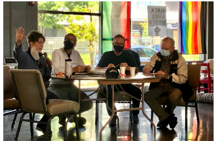
2022 Cohort Gathering

Churches have hundreds of acres of underutilized land and are the second largest landowners in the U.S. Meanwhile, our communities are navigating immense housing, climate and other crises. Together, we have an opportunity to bring God's vision of Shalom to life.